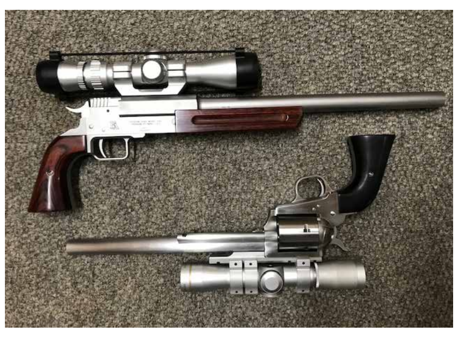
On top: 338 Freedom Arms Federal single shot pistol. Below: .454 Casull Freedom Arms revolver.

Day Three: We had a 3.30 a.m. start to the area where the buff came to a waterhole, so we could track them after their morning drink. Unfortunately they did not turn up, so as daylight began we drove along the road looking for fresh tracks. About an hour later